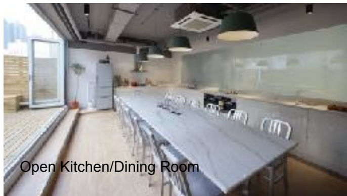
Open Kitchen/Dining Room